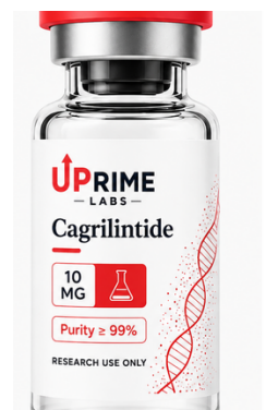
Cagrilintide 10mg - CAG0001