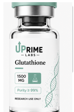
Glutathione 1500mg - N/A