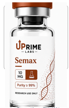
Semax 10mg - SMX0001