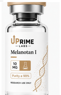
Melanotan I 10mg - MI0001