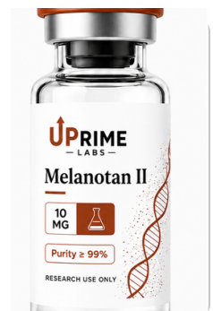
Melanotan II 10mg - MII0001