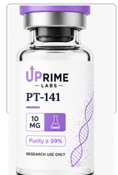
PT-141 10mg - PT0001