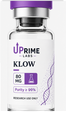
KLOW 80mg - KLW0001